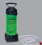
Water tank 10 l metal, incl. 3.5 m hose with Gardena-Connector